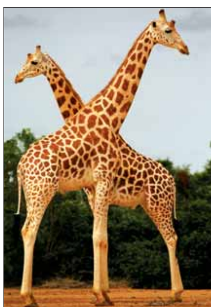
In this Aug. 1 photo, a pair of giraffes from Africa's most endangered giraffe subspecies nuzzle as they stand in the bush near Koure, Niger.