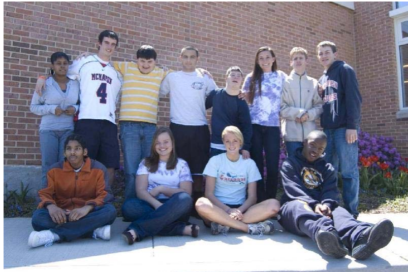
Brien McMahon High School Best Buddies